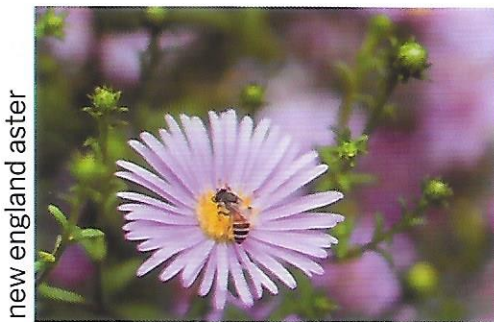
new england aster