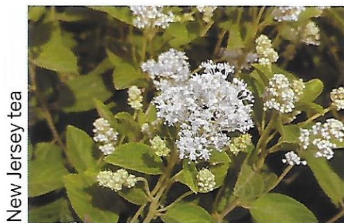
New Jersey tea