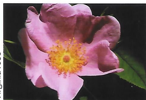
Rosa virginiana (S)