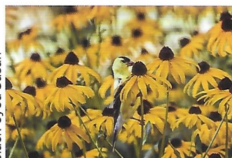
Rudbeckia (P FS)