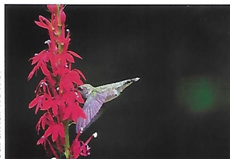
Lobelia (P C Hummingbirds)