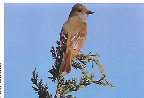
Juniperus virginiana (S C FS CV)

KEY: Tree (T) Shrub (S) Perennial (P) Fruit & Seed (FS) Caterpillars (C) Cover (CV)