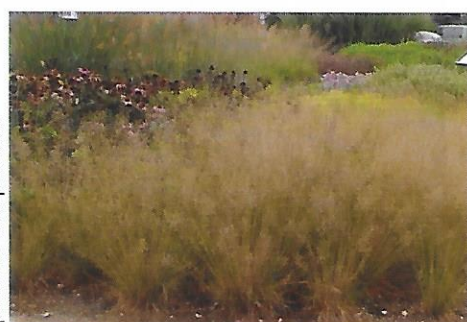
Sporobolus (P FS)