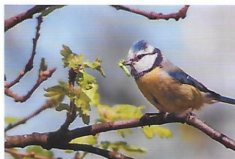
Quercus (T C CV)