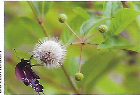
Cephalanthus (S FS CV)