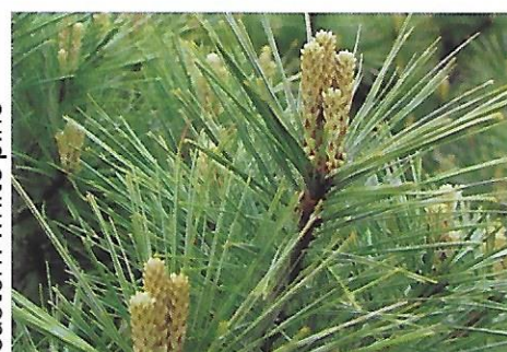
Pinus strobus (T C FS CV)