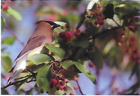
Amelanchier (T C FS CV)