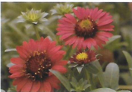
Gaillardia (P FS)