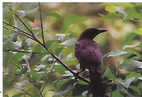
Lindera (S C FS CV)