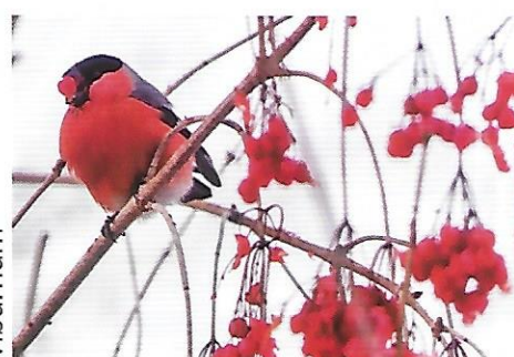
Viburnum (S C FS CV)

KEY: Tree (T) Shrub (S) Perennial (P) Fruit & Seed (FS) Caterpillars (C) Cover (CV)