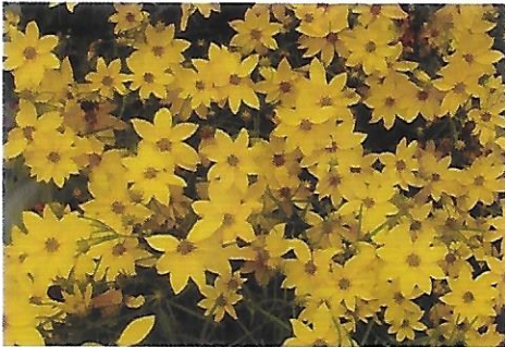
Coreopsis (P FS)