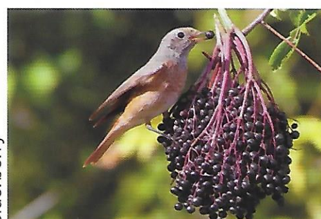
Sambucus (S FS CV)