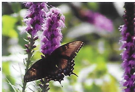
Liatris (P FS)