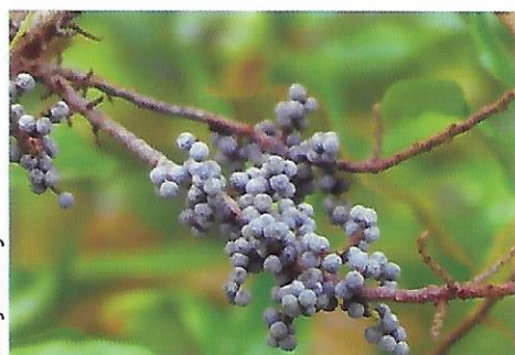
Myrica (T FS CV)