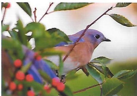
Ilex verticillata (S FS CV)