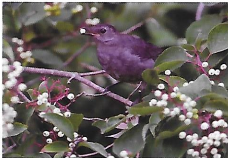
Cornus (S T C FS CV)