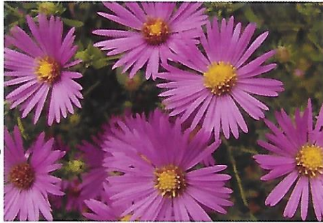
Aster novae-angliae (P C FC)