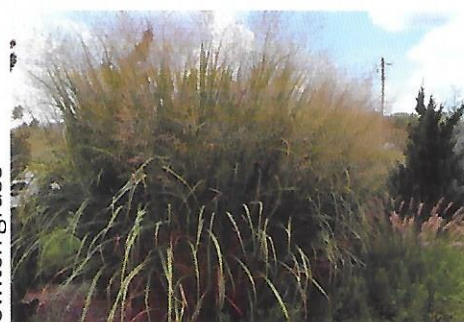
Panicum (P FS)