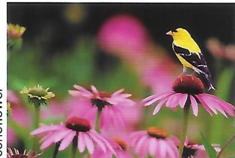
Echinacea (P FS)