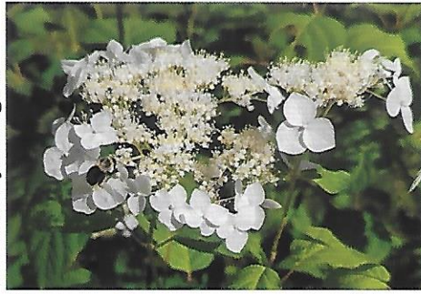
Hydrangea arborescens (S)