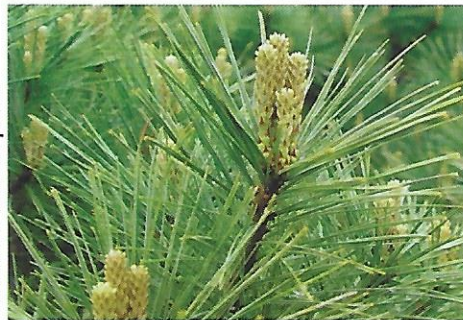
Pinus strobus (T)