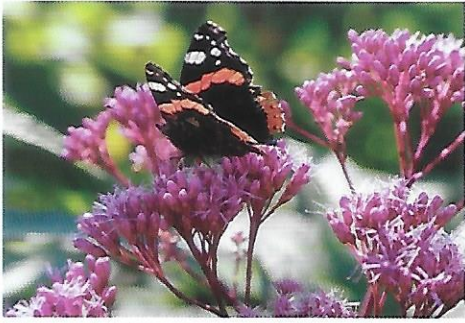
Eupatorium syn. Eutrochium (P)